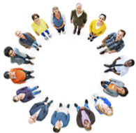
The motto: United in diversity