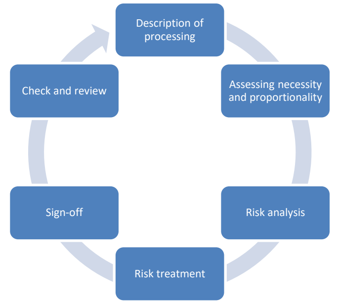
Figure 3: Generic DPIA process

DPIAs are a cyclical process , not a one-off exercise. When you do a DPIA during the development of a new process, it does not stop once the process is adopted and rolled out. If you change the process, your risk environment changes, or simply after a certain period, you have to revisit your DPIA, check if it still reflects reality and update it when required.