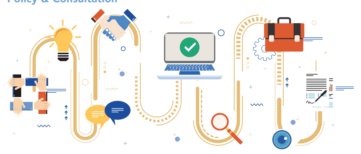
3.2. Policy & Consultation

We continued to act as an advisor to the EU's co-legislators - the European Commission, the European Parliament and the Council - on all new proposed legislation potentially impacting individuals' rights to privacy and personal data, we contribute to shaping a safer digital future for the EU and its citizens.