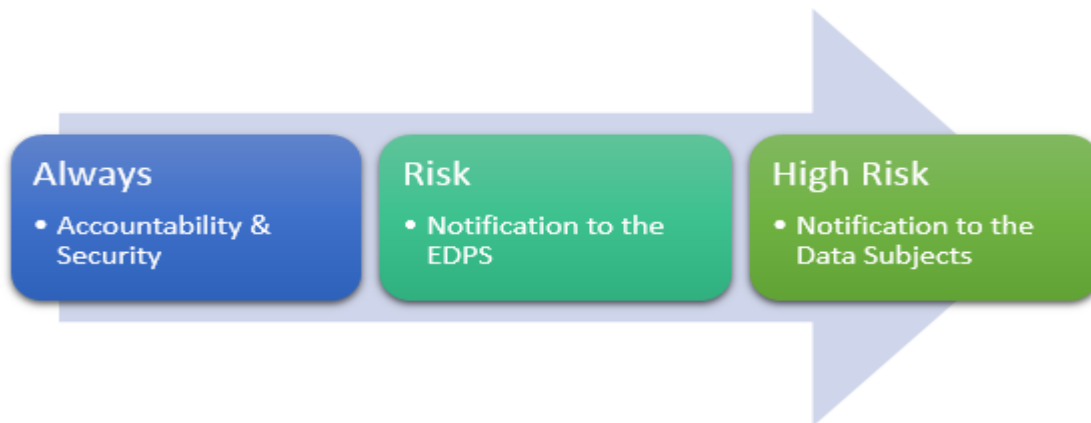
Diagram 1. Step by step duty perspective for the controllers