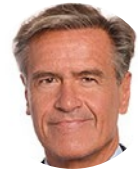
JUAN FERNANDO LÓPEZ AGUILAR

EUROPEAN PARLIAMENT CHAIR OF THE COMMITTEE ON CIVIL LIBERTIES, JUSTICE AND HOME AFFAIRS