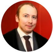
PIETER VAN CLEYNENBREUGEL