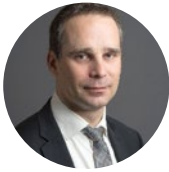
GWENDAL LE GRAND

EUROPEAN DATA PROTECTION BOARD HEAD OF ACTIVITY FOR ENFORCEMENT SUPPORT AND COORDINATION